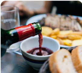
Lugano Food & Wine tasting