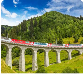
1st class on the Glacier Express Panoramic Train