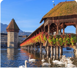
Luzern Lake Cruise and Funicular Train to Bürgenstock