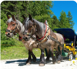
St Moritz Horse & Carriage Ride