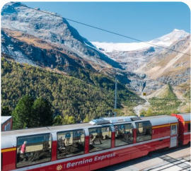
1st class Bernina Express Panoramic train