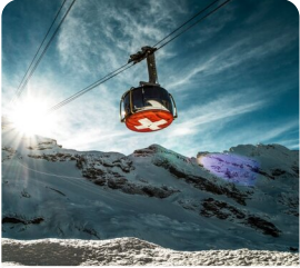
Titlis Rotair Cable Car Rotating Cable Car and Mount Titlis Lunch