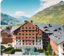
Andermatt Gütsch cable car and 'My Time'