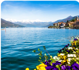
Bellagio on Lake Como Private Boat Cruise

These are just a few of the very special hand selected experiences that will really make your touring experience exceptional and unique, and don't forget, with Albatross they are always included.