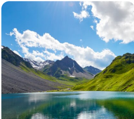
Arosa Alpine Village Mountain lunch and Bear sanctuary