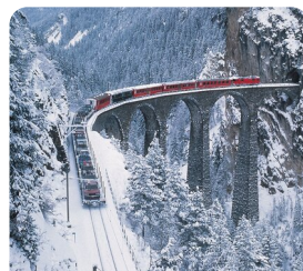
The Glacier Express Panoramic Train