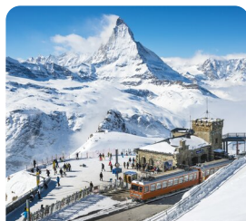
Zermatt Ride the Gornergrat Cog Railway