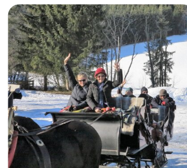
Horse and Carriage Ride Through the Local Countryside