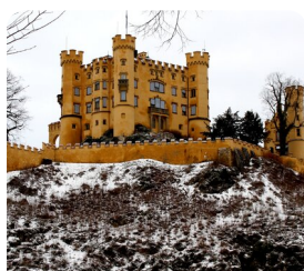
Hohenschwangau Castle Guided Tour