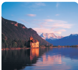
Chateau Chillon Guided Tour