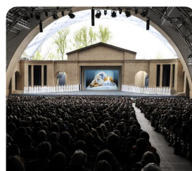
Oberammergau Passion Play Theatre Guided Tour