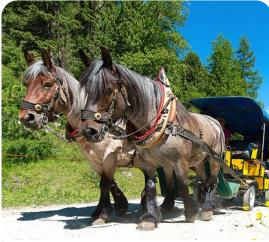
St Moritz Horse & Carriage Ride