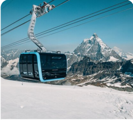
The Mighty Matterhorn Experience Trans-alpine cable car journey