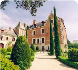
Amboise Da Vinci's Residence