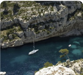
Calanques Cruise Along the Côte d'Azur