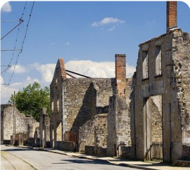
Oradour-sur-Glane Visit the 'Ghost Village'