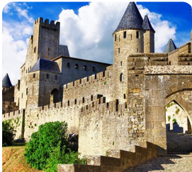
Carcassonne Guided Walking Tour