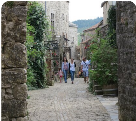
Millau La Couvertoirade, Millau Viaduct & Roquefort cheese