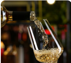
Loire Valley Wine Tasting

These are just a few of the very special hand selected experiences that will really make your touring experience exceptional and unique, and don't forget, with Albatross they are always included.