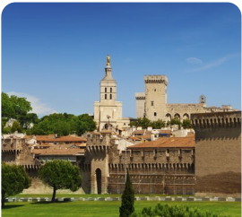
Avignon & Pont du Gard 'City of the Popes' & Ancient Roman Aqueduct