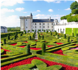
Château Villandry Magnificent Gardens