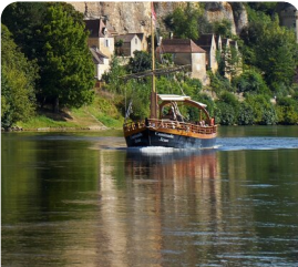
Dordogne Sarlat & La Roc Gageac