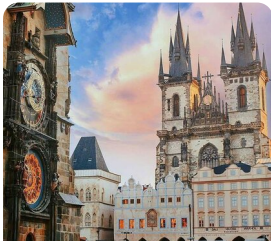
Prague Visit Prague Castle