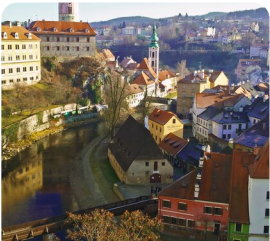
Cesky Krumlov Guided Tour