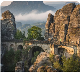
Saxon Switzerland Visit the Pristine National Park