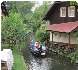
Lübbenau Punt Ride on the Spreewald