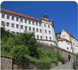
Colditz Castle Guided tour of the Infamous 'Escape Castle'