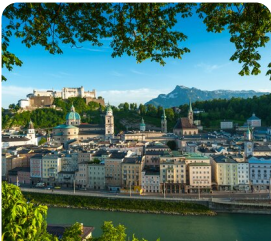
Salzburg Guided Walking Tour