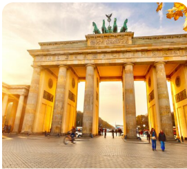
Berlin Guided Panoramic Tour

These are just a few of the very special hand selected experiences that will really make your touring experience exceptional and unique, and don't forget, with Albatross they are always included.