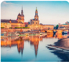
River Elbe Boat Cruise Pillnitz to Dresden