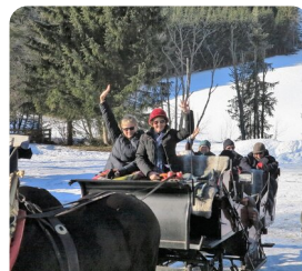
Horse and Carriage Ride Through the Local Countryside