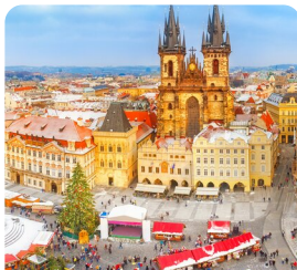
Prague Sightseeing Tour & Christmas Markets