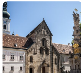
Heiligenkreuz Monastery Guided Tour