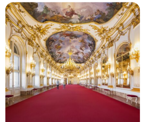
Schönbrunn Palace Guided Tour