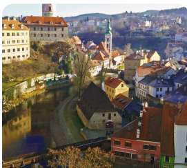
Cesky Krumlov Guided Tour