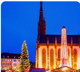
Würzburg Christmas Markets

These are just a few of the very special hand selected experiences that will really make your touring experience exceptional and unique, and don't forget, with Albatross they are always included.