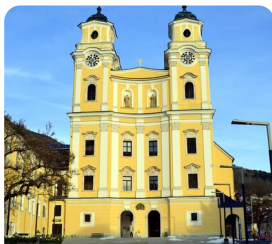
Mondsee The 'Sound of Music' Wedding Church