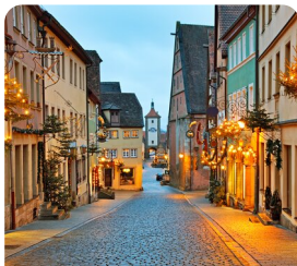
Rothenburg Night Watchman Walking Tour