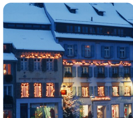
Freiburg Freiburg visit