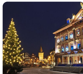
Gengenbach Visit to Gengenbach