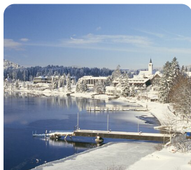
Lake Titisee in winter Visit to Lake Titisee