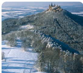
Hohenzollern Castle Visit to Hohenzollern Castle