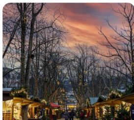
Baden Baden Christmas Market Walk through Baden Baden