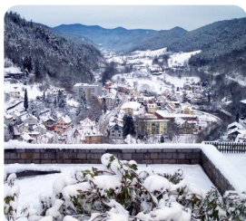
Hornberg Christmas in the Black Forest