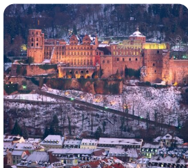
Heidelberg Visit Heidelberg

These are just a few of the very special hand selected experiences that will really make your touring experience exceptional and unique, and don't forget, with Albatross they are always included.