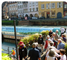
Strasbourg River cruise