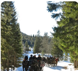
Horse and Carriage Ride Horse and carriage ride