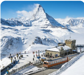
Gornergrat Funicular train