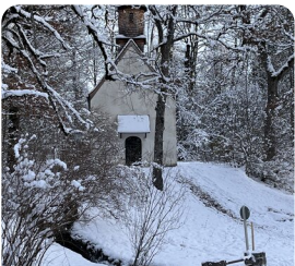
Linderhof Palace Guided tour