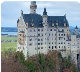
Neuschwanstein Castle Fairytale castle of 'Mad' King Ludwig

These are just a few of the very special hand selected experiences that will really make your touring experience exceptional and unique, and don't forget, with Albatross they are always included.