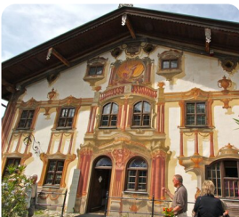
Oberammergau Visit the village of Oberammergau