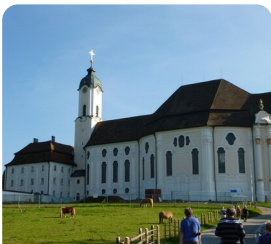
Wieskirche Church in the meadows