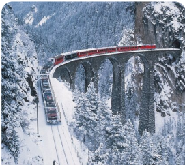
The Glacier Express Board the famous Glacier Express