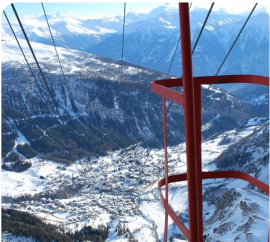
Mount Gemmi Cable car ride