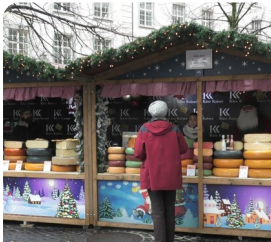
St. Gallen Markets Lunchtime visit