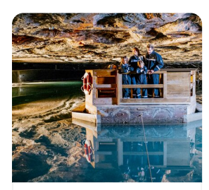
Berchtesgaden Berchtesgaden & the Salt Mines