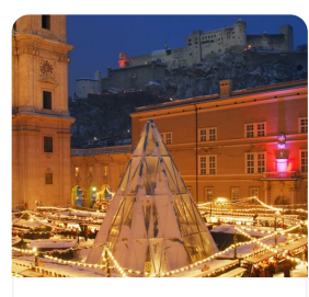
Salzburg Christmas Markets