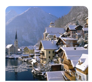
Hallstatt Hallstatt in the Salzkammergut