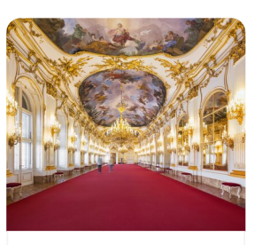
Schönbrunn Palace Schönbrunn Palace guided tour