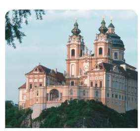
Melk Monastery Private guided tour