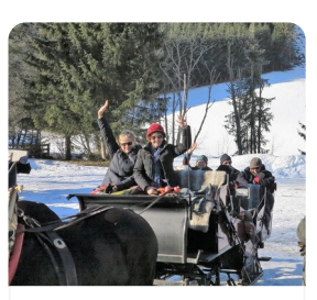
Horse and Carriage Ride