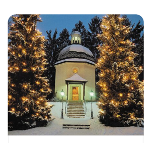
Silent Night Chapel Silent Night Chapel