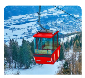
Bad Ischi Cable Car Cable car ride up Mount Katrin