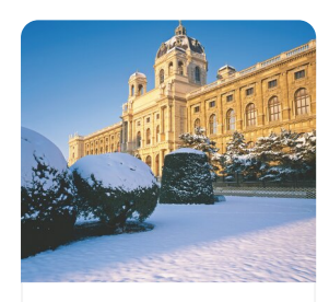
Vienna Vienna in all its glory

These are just a few of the very special hand selected experiences that will really make your touring experience exceptional and unique, and don't forget, with Albatross they are always included.